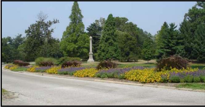
Willow Lake seasonal flower border