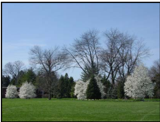
Magnolias at Spring Grove

maples - a compact, globular tree- that was allowed to spread to specimen form in open spaces. In 1865, Paris, Kentucky, sent 400 holly trees to "ornament" Spring Grove. In 1870, Strauch and Probasco ordered diverse vines, shrubs, and trees from England; in 1876, magnolias from Memphis; in 1878, a thousand red pines and many spruce.