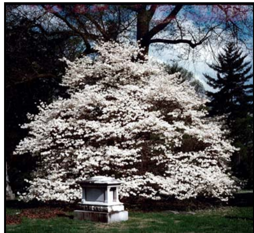
Spring Grove Dogwood

Spring Grove remains an arboretum with over 1,200 species, 1,000 labeled for study. Twentieth-century management developed an extensive collection of flowering trees, shrubs, and perennials, periodically importing new species.